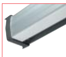
Solid aluminum tube