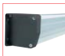
Plastic end caps for wall or ceiling installation