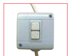
Switch of the electric Silverline